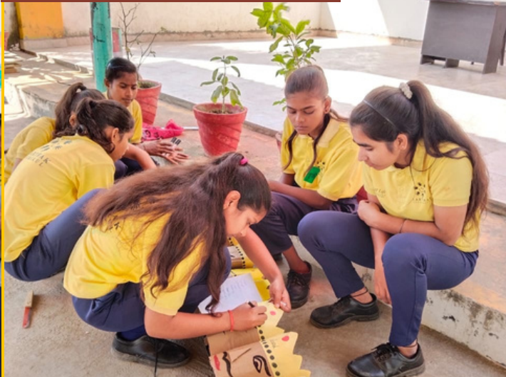
Made Ravan effigy from scrap