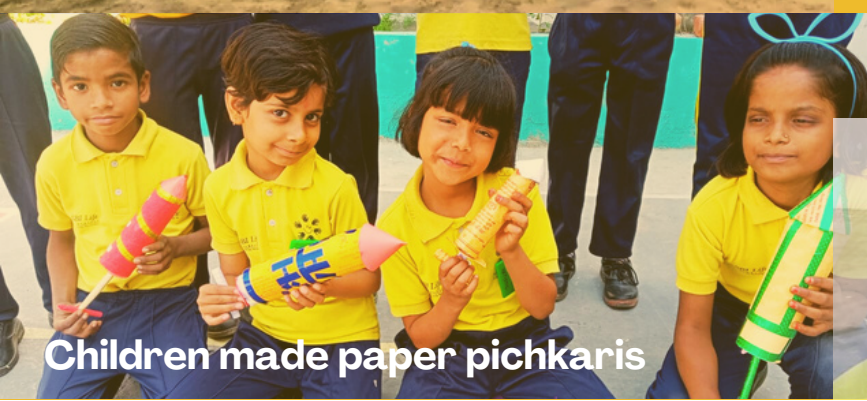
Children made paper pictharis