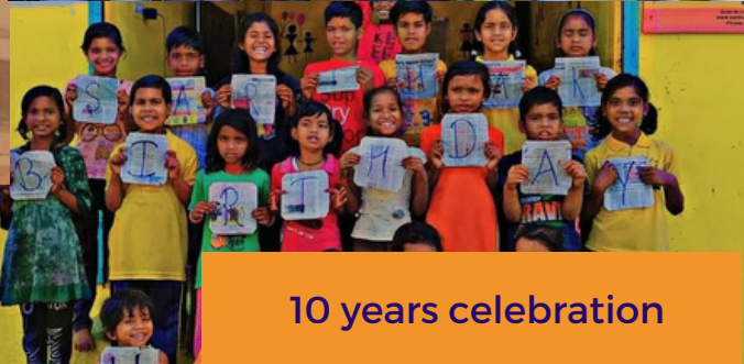
10 years celebration

Thank you for all the hard work and dedication you all put into making our future. Yellow Rooms are wonderful place for learning. We learn many things by doing many activity. We have lot of fun.