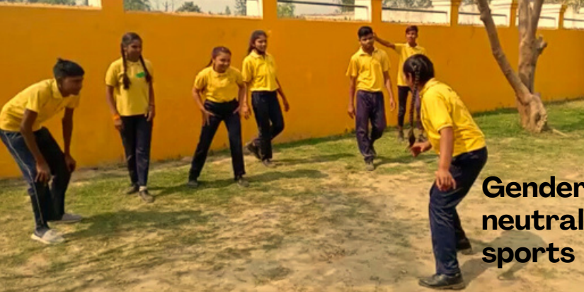
Gender neutral sports